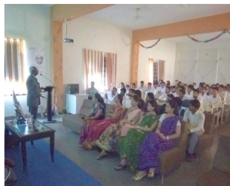
Guest Lecture organised by LNCP