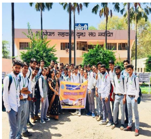
INDUSTRIAL VISIT AT SANCHI DUGHDH SANGH