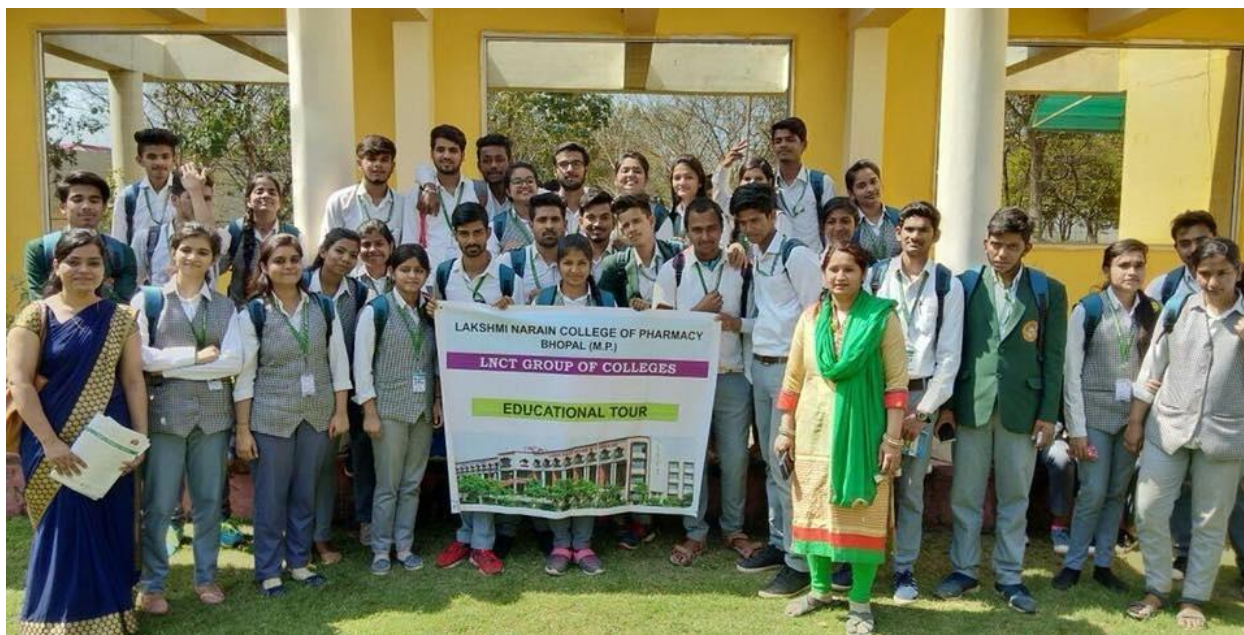
Industrial visit at MFP Processing & Research Centre, Bhopal