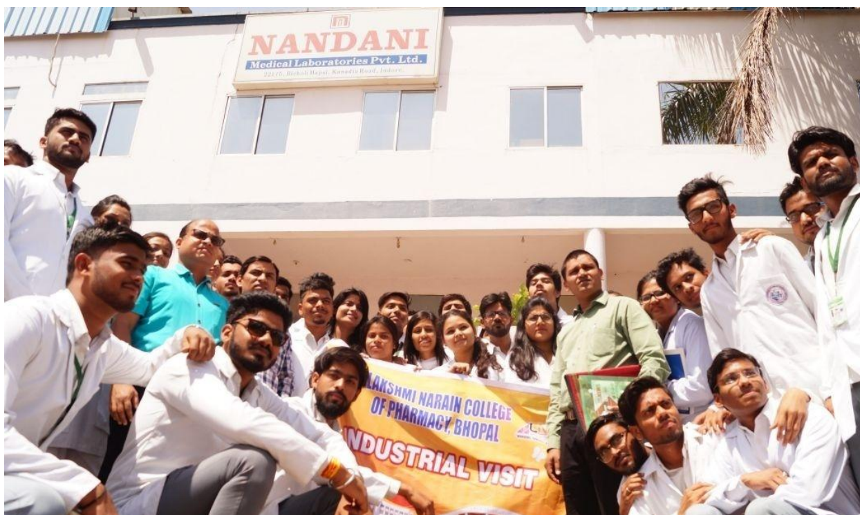
Industrial visit at Nandini Medical Laboratories Pvt. Ltd, Indore