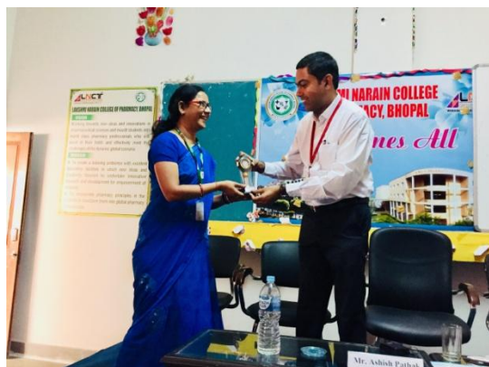
Guest Lecture organised by LNCP